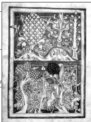
From the 11th-13th Century Carmina Burana , a collection of love and vagabond songs.

DATE: Sunday, May 6 TIME: Rehearsal 3-5pm CALL TIME: TBA PERFORMANCE: 8pm WHERE: Joseph Meyerhoff Symphony Hall